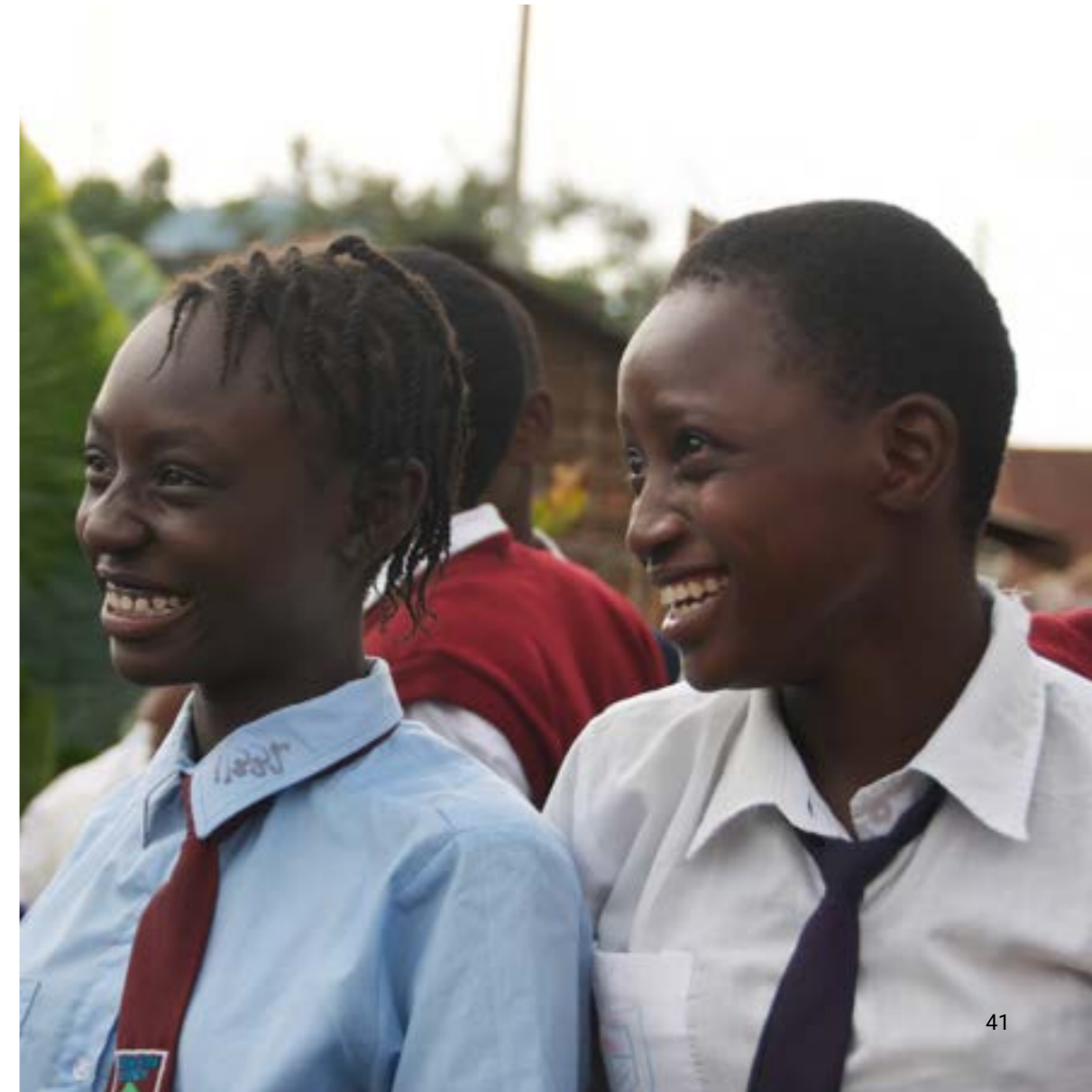
Pictured: two school girls at a community meeting aimed at creating awareness of the Friendship Bench initiative.