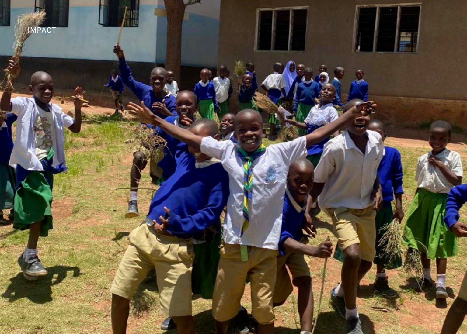
Pictured: a group of school children in Mwanza, Tanzania, supported into school by Egmont Partner Fanisi.

Our Partners help children stay in school—one of the most cost-effective ways to bring about long-term, sustainable change not just in individual lives, but across entire communities.