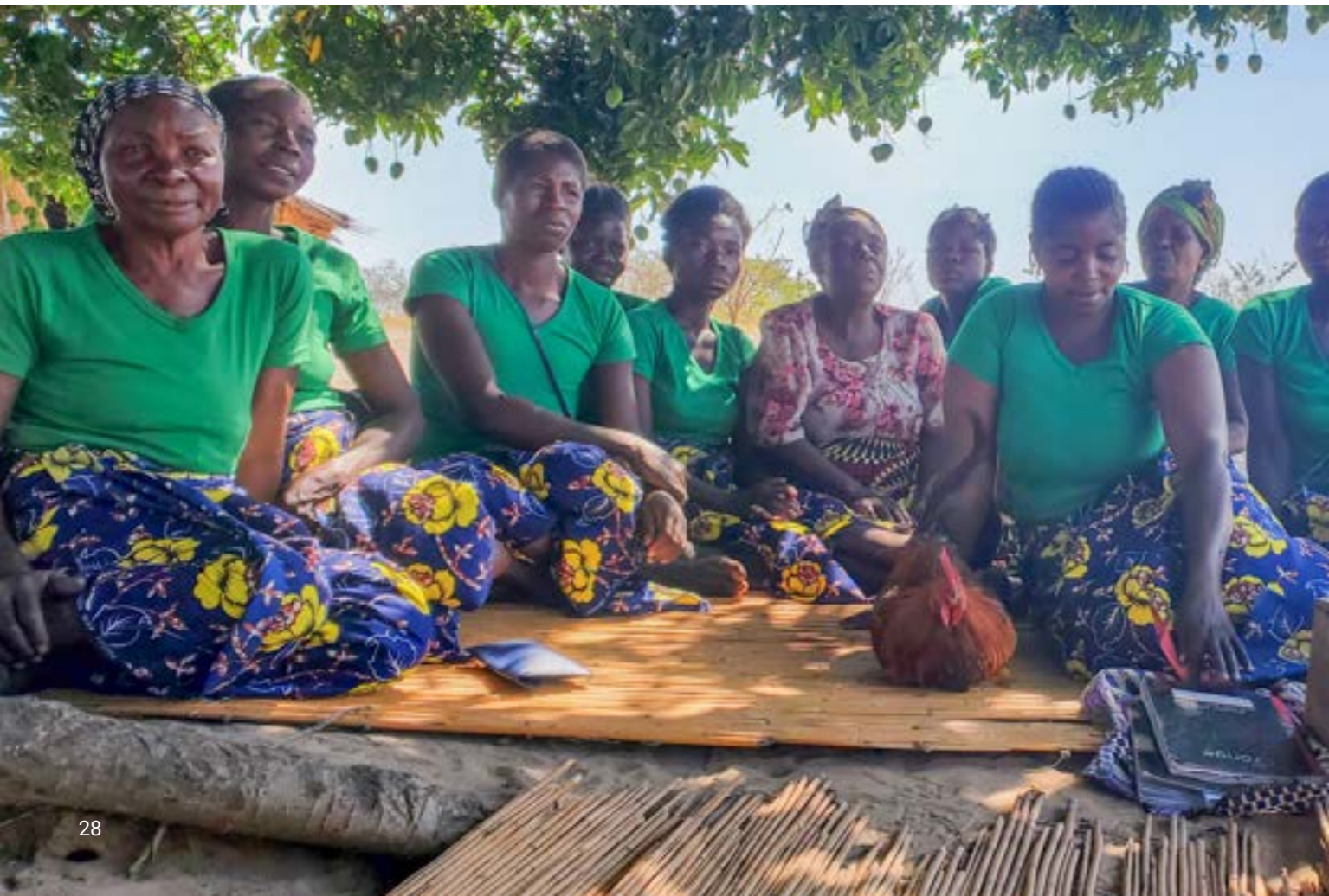
Pictured: A meeting of a business support group supported by Keepers Foundation. Such groups provide financial literacy and business training, allow members to save and access credit with lower interest rates than traditional banking, and provide a forum for members to discuss business opportunities.